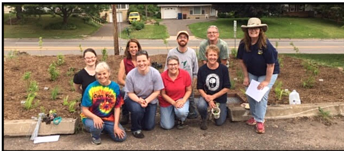
Ramsey County Master Gardeners plant a new demonstration rain garden at our home, "The Barn", 2020 White Bear Ave, Maplewood, MN 55109

Enjoy a visit to Frogtown Park and Farm on from 10 am to 1 pm. on Saturdays. Organic produce, food and fun activities for the whole family!