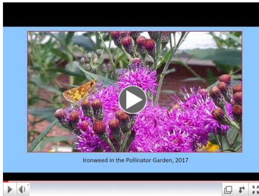
The Barn Demonstration Gardens, 2017 and 2018

you might be able to meet some Master Gardeners working on the garden area or in the clinic.