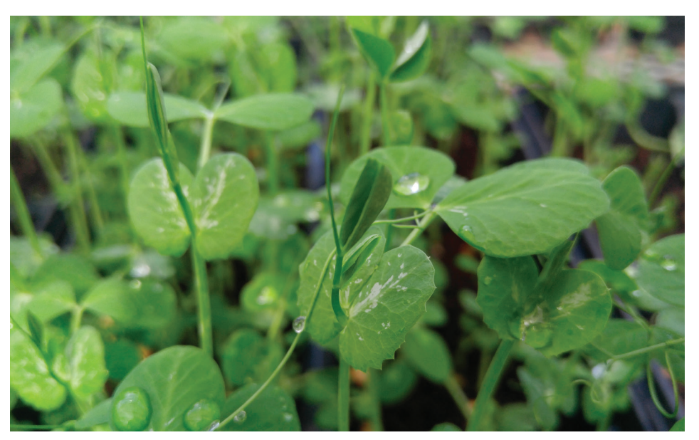
Figure 8. Pea microgreens ready for harvest.

Microgreens are used fresh and can be added whole or chopped into various dishes. Coarsely chopping herb microgreens helps to bring out their unique flavors and aroma. Microgreens should not be heated since they quickly deteriorate when cooked, although they can be added as garnish on top of hot dips or dishes. They can be used liberally in cold dishes like salads, smoothies and sandwiches. Microgreens are unique greens that can be used to enhance the visual appeal, texture, flavor and nutrition of snacks and meals at home.