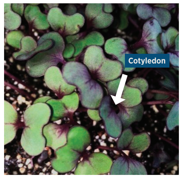
Figure 5. Red cabbage microgreens at the cotyledon stage after 16 days.