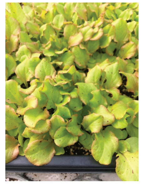
Figure 1b. Speckled loose-leaf lettuce microgreens.

when grown in the garden. Cool-season crops, such as broccoli and arugula, will germinate well with temperatures around 70 F, but can also grow at slightly lower temperatures. Warmseason crops, such as amaranth (Figure 1) and basil, will germinate more quickly and at a higher percentage when temperatures are 75 to 80 F. Also consider the light available. Some cool-season crops, such as lettuce (Figure 1b) and arugula, may perform better under slightly lower light conditions than basil and