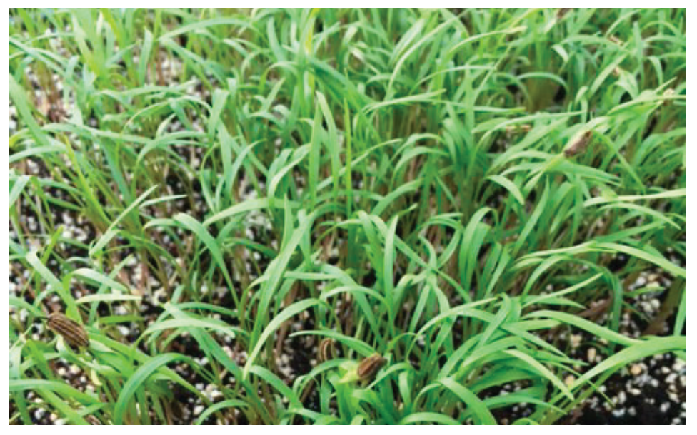
Figure 2. Fennel microgreens grown in soil in a shallow germination tray at 14 days.

• Ease of production — Due to differences in location and management practices, it is difficult to precisely list easy and challenging microgreen crops. Some of the coolseason crops in the Brassica family, such as broccoli, arugula, radish and pac choy, can be good crops to try initially due to their moderate light and temperature needs and relatively quick growth rate. Basil, cilantro, fennel, parsley and carrot tend to be slower germinating and/or growing, which can