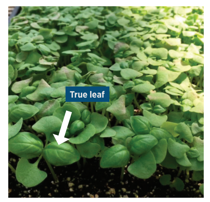
Figure 6. Basil microgreens at the true leaf stage after 25 days.

container may reduce watering frequency. Larger seeds are generally covered with 1/4 inch of substrate to prevent drying during germination (i.e., pea, beet, chard and sunflower). Small seeds — such as arugula, kale, broccoli, amaranth, chives and basil — are often simply seeded and then watered in. As long as the substrate is kept moist, they will germinate well without being covered.