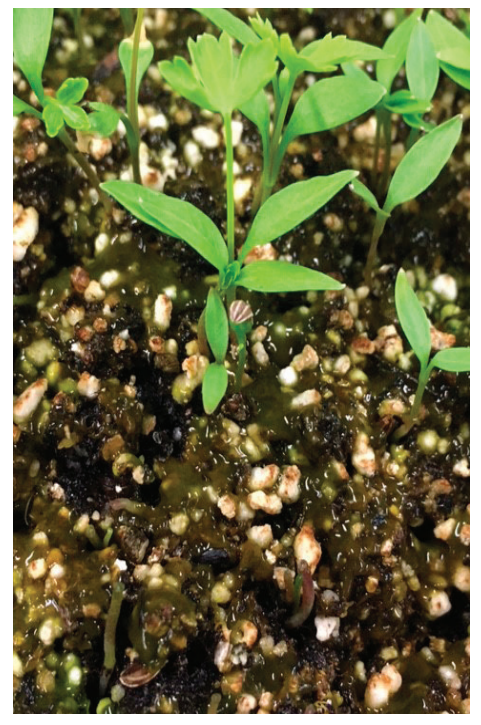
Figure 7. Algae growing on substrate around parsley microgreens.

seedling death are often linked to over seeding, over watering, poor airflow, low light levels and extreme temperatures. Algae growing around young plants can become a problem with microgreens that are slow growing, but it generally poses little threat to plants (Figure 7).