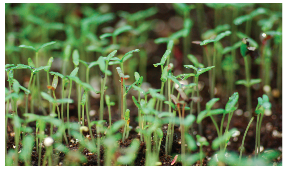
Figure 1a. Amaranth microgreens.

to become familiar with these greens if they are new to your palate and diet. Studies have shown that these immature crops, when compared to mature vegetable crops, can contain higher concentrations of antioxidants and other phytonutrients potentially beneficial to human health.