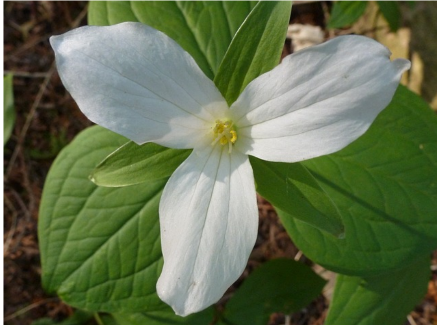
Click on the pic to learn more about this early spring wildflower.